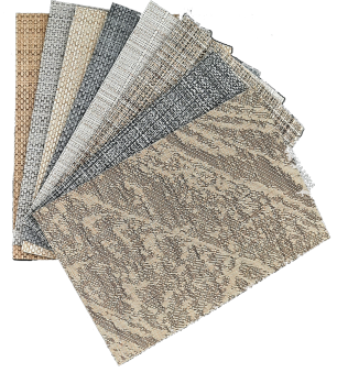
Dura Foam 1 Textures